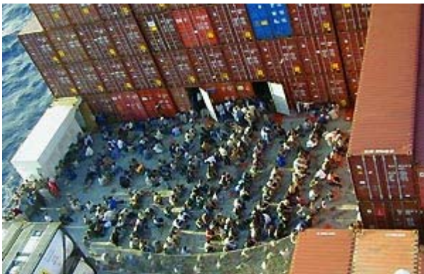
The deck of the Tampa

On 25 August 2001, the Rescue Control Centre at the Australian Maritime Safety Authority instructed the Norwegian container carrier Tampa , on its way from the Western Australian port of Fremantle to Singapore, to assist a boat in distress about 55 nautical miles from Christmas Island. The Tampa rescued 433 refugees, most of them Hazaras fleeing the Taliban, and 5 Indonesian crew from the Palapa 1 , a 20-metre Indonesian ferry which would have been ill-suited under the best of circumstances to carry such a large number of passengers.